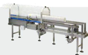
Bucket denester Wide range adjustable bucket denester.