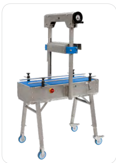
Stand-alone lid pressing roller Wide range adjustable lid pressing roller on a conveyor belt to close the bucket with the lid.

Van Rijn has developed a wide range of machines for filling and sealing of various buckets and cans. Our installations are custom-made, using standard modules and parts.