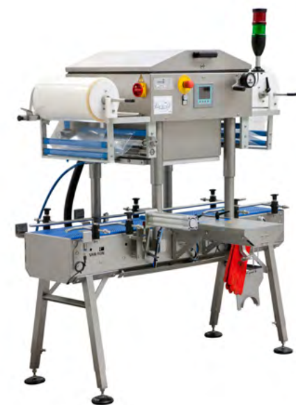
Seal machine Our seal machine on conveyor belt, equipped with dosing-cylinder and position plate. As an option, we can also protect your product by gas filling.