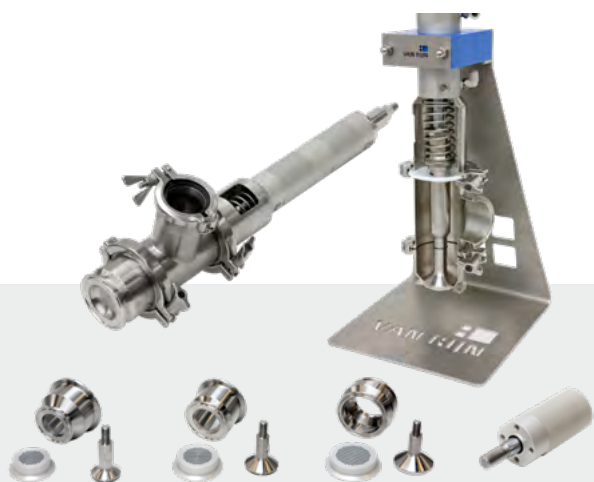
Dosing valve Dosing valve with full and/or fine settings, developed using the latest technologies and can be supplied with an ATEX EX certificate. Because of its modular structure, the discharge can easily be adjusted to suit the product properties.