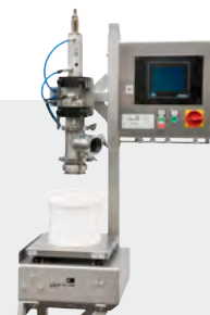
Filling unit Weighing unit with display and dosing valve. Suitable for certified weighing.